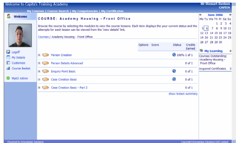
Example of course layout screen (Not production version)